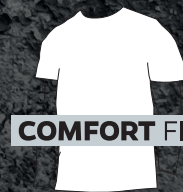
Classic standard fit